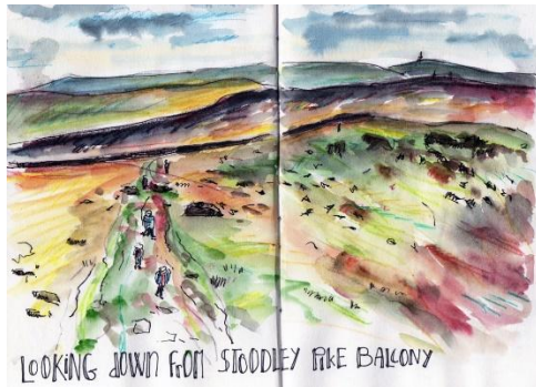
Fig. 1. Pictorial depth explored through rough brushstrokes, black lines and muted colors.