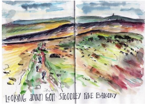
Fig. 1. Pictorial depth explored through rough brushstrokes, black lines and muted colors.