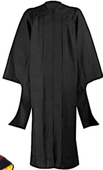
MFA Graduation Gown