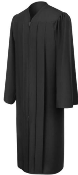
BFA Graduation Gown