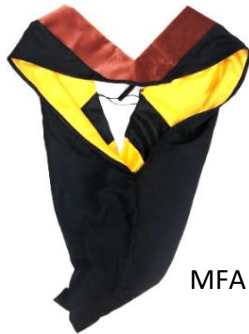
MFA Graduation Hood

Cap is worn flat on the head. Tassel stays on the left side of the cap and will remain there until the ceremony is complete.